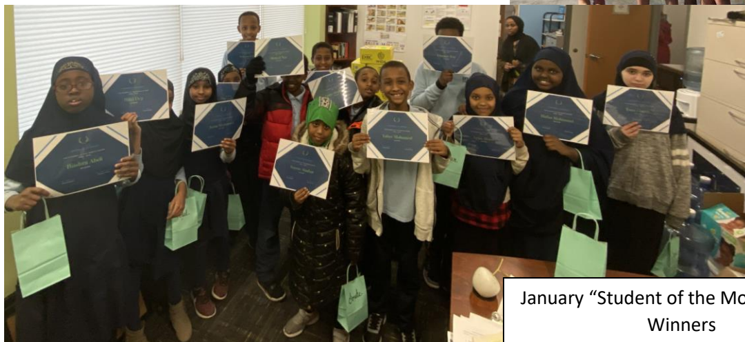
January "Student of the Month" Award Winners